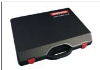
931-22-100 Optional Carrying Case